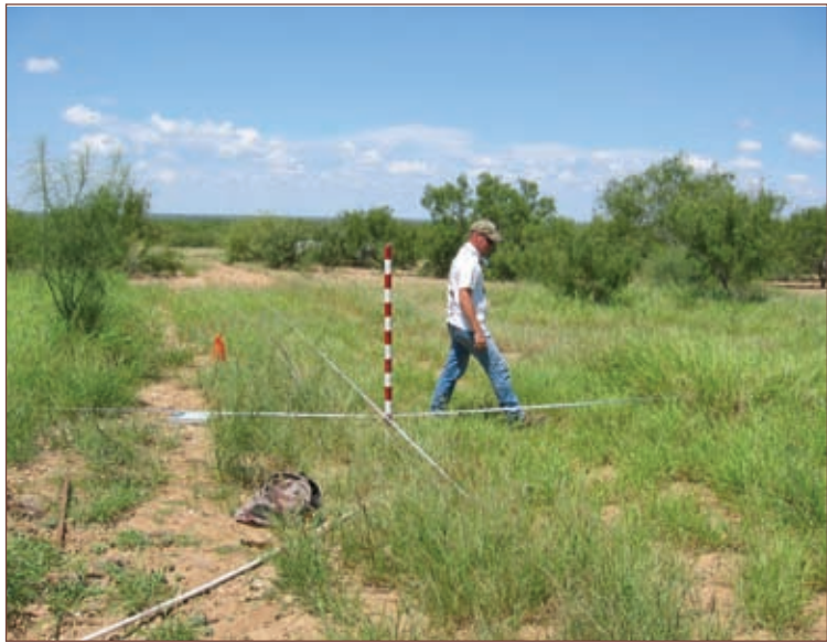
Figure 2. A Robel range pole, which marks the position of the roost site, was used to measure visual obstruction of vegetation. Line transects were established in the four cardinal directions to assess habitat features surrounding roost sites.